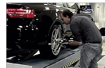
3 point + quick locking system for quick setup.