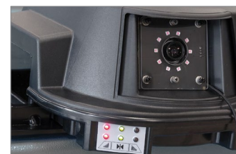
LED repeater for guided measurements without monitor.