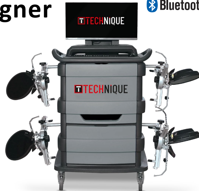
Control center complete with printer, keyboard, and mouse.