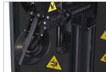
Sensor with automatic indent function.