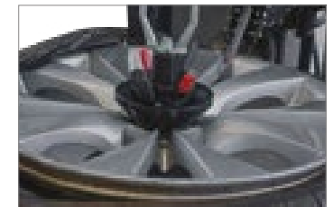
Quick clamping lock for rims.