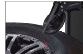
Laser pointer that indicates proper head positioning.