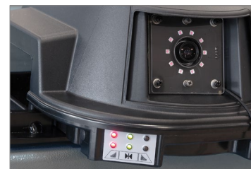
LED repeater for guided measurements without monitor.