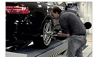
3 point + quick locking system for quick setup.