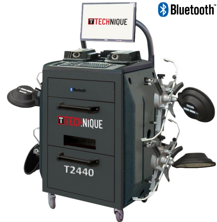
Control center complete with printer, keyboard, and mouse.