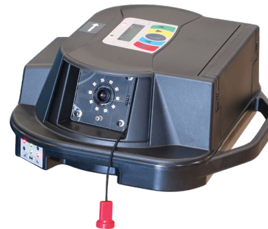
High resolution megapixel camera.