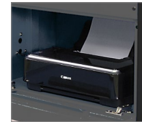
Full colour printer.