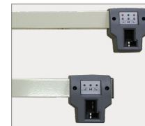
LED signal repeaters on each measuring head.