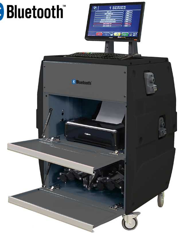
Mobile control unit complete with a PC, 19" monitor, keyboard, printer and battery charger.