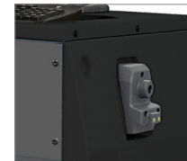
Supports house measuring heads and recharge batteries.