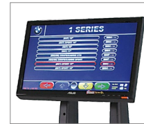
20" full colour TFT monitor.