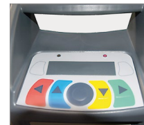
Keyboard with remote control function.