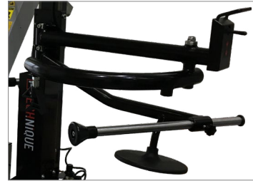
T2205 PLUS assist arms.