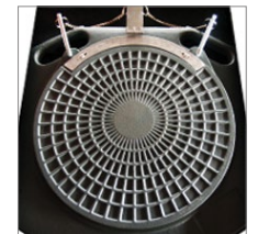
Recessed front bearing mounted turn plates.