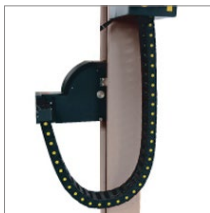
Oil hose protection.