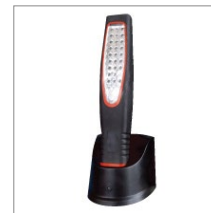
Wireless LED torch controlling play detector system.