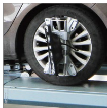
Rear alignment slip plates.